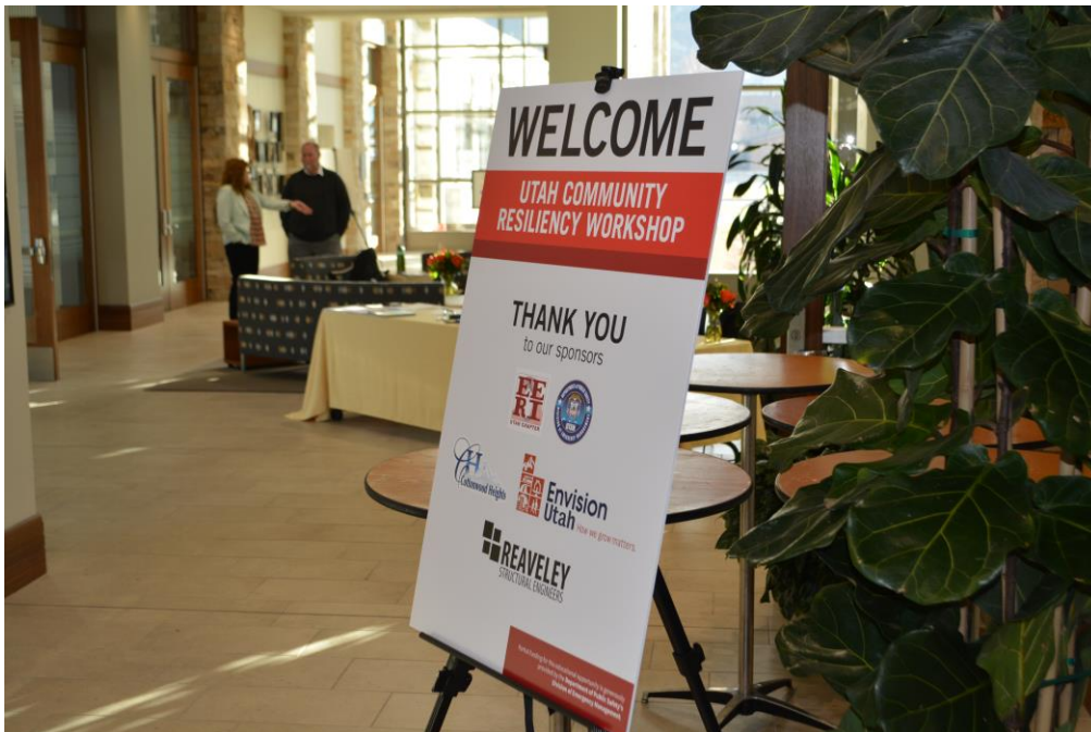
Figure 4 - Photos taken from the Utah Community Resiliency Workshop held at City Hall on Friday Feb. 9th