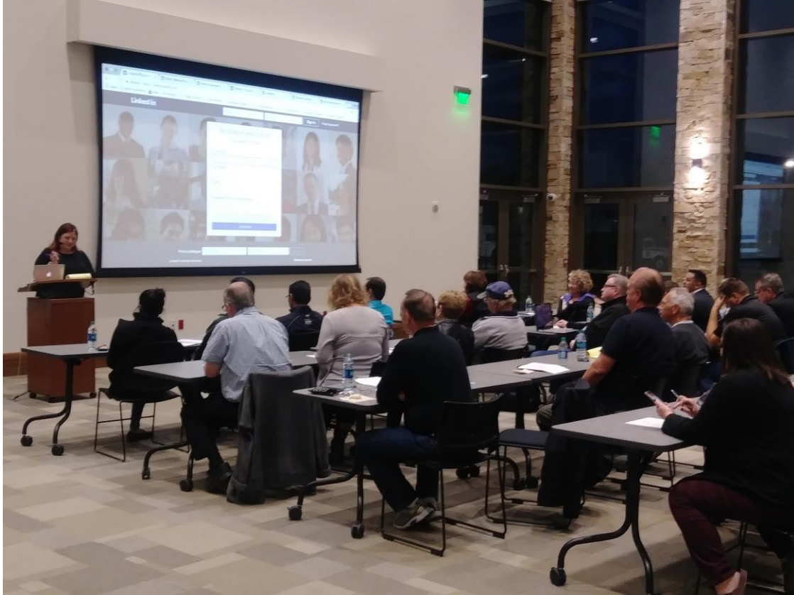
Figure 2- LinkedIn Boot Camp was a great success.