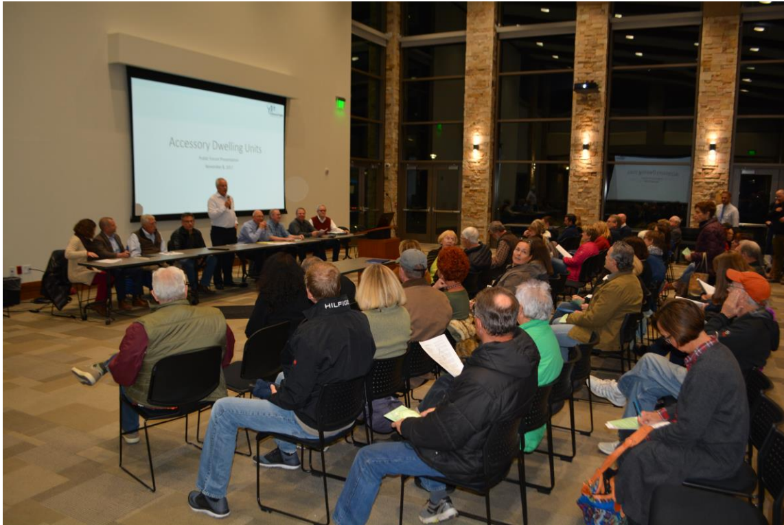
Figure 4 - Mayor Cullimore chaired the joint City Council, Planning Commission Town Hall Meeting on Accessory Dwelling Units.