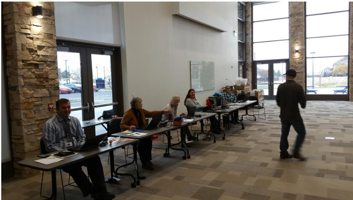
Figure 5 - Election judges were on hand Nov. 7th for citizens to cast their vote.